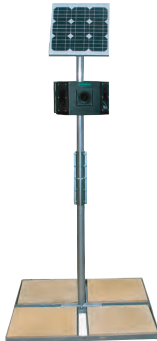
SOLAR COMPACT 1313

THE FIRST UK BIO-ACOUSTIC BIRD DISPERSAL PRODUCT POWERED BY RENEWABLE ENERGY